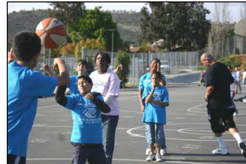
Youth Members participate in quality programs with caring Youth Development Professionals