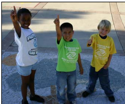
It just takes one person to make the difference in the life of a child